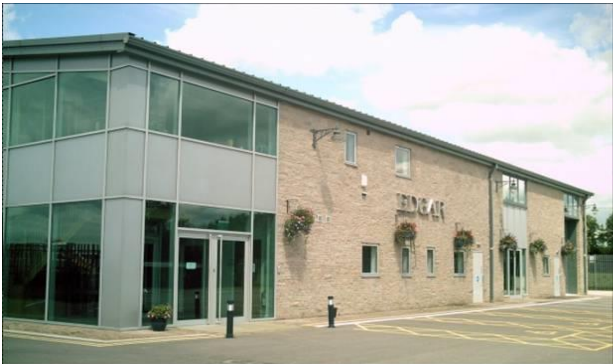
The Edgar Hall, Somerton.